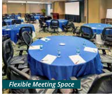
Flexible Meeting Space