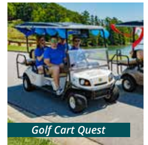
Golf Cart Quest