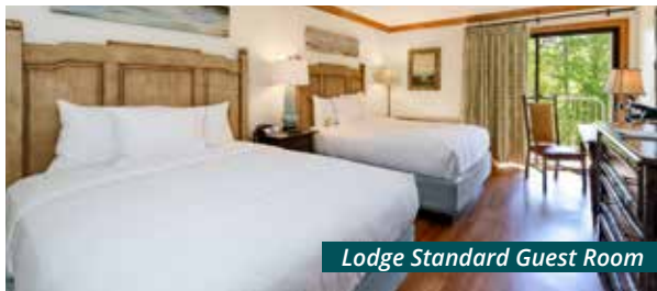
Lodge Standard Guest Room