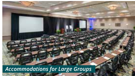
Accommodations for Large Groups