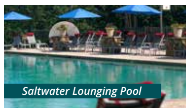
Saltwater Lounging Pool