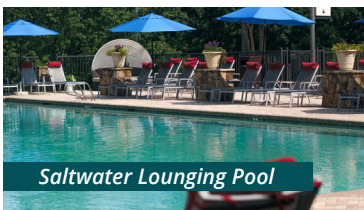
Saltwater Lounging Pool