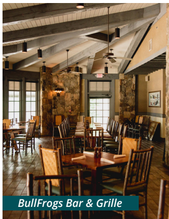
BullFrogs Bar & Grille