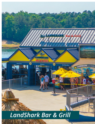
LandShark Bar & Grill