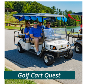
Golf Cart Quest