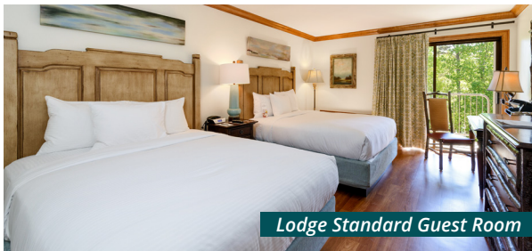
Lodge Standard Guest Room