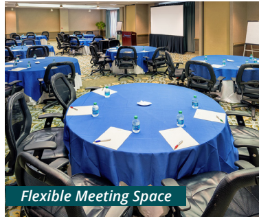
Flexible Meeting Space