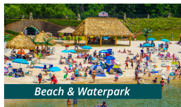
Beach & Waterpark