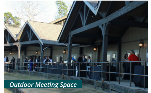
Outdoor Meeting Space