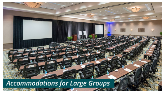
Accommodations for Large Groups