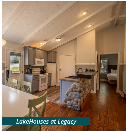
LakeHouses at Legacy