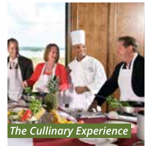
The Cullinary Experience