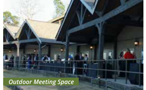
Outdoor Meeting Space