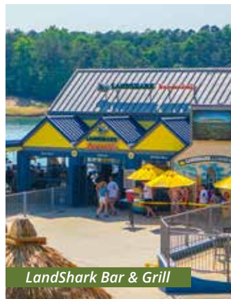
LandShark Bar & Grill