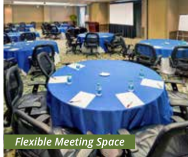
Flexible Meeting Space