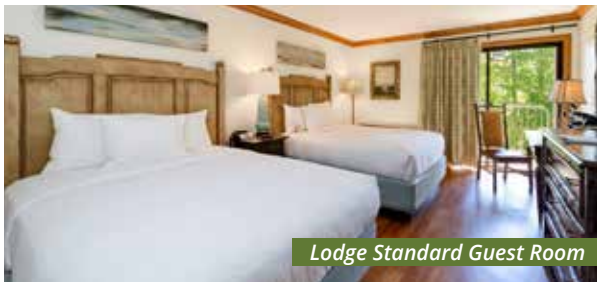
Lodge Standard Guest Room