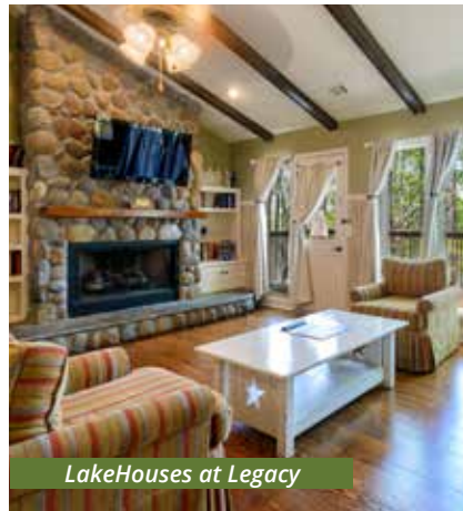
LakeHouses at Legacy