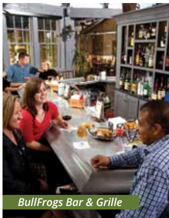
BullFrogs Bar & Grille