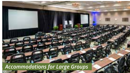
Accommodations for Large Groups