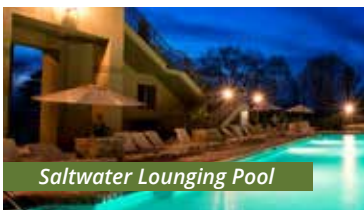
Saltwater Lounging Pool