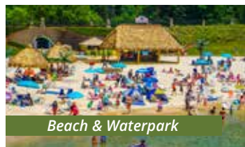
Beach & Waterpark